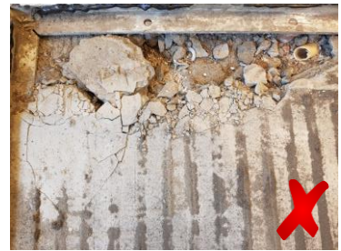
Bad conditions. Do not install the entrance mat. This will damage the entrance mat.