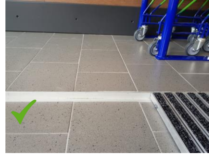
3 & 4) Place and unroll the entrance mat